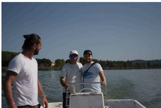
Tuscanmagic - Cortona Consigliato fra le Activities in Cortona da: